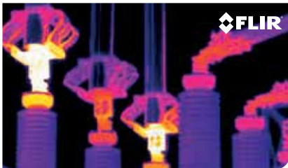
Thermal image of a substation showing a transformer with excessive temperature.