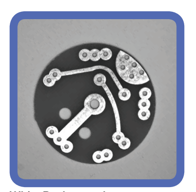
White Background Blue LED No Filter

Backlights provide sharp contrast to outline a shape, edges or an opening. But applications with space constraints may dictate backlight utilization. MidOpt introduces the backlight FluoreSheet™ (BF590). When the FluoreSheet™ is illuminated from the front with a blue LED light, it emits an orange fluorescence. A backlight effect can be created by using a MidOpt orange Bandpass Filter (BP590) to capture the orange emission and block the blue LED excitation, giving the appearance of a bright white diffuse background in a monochrome image.