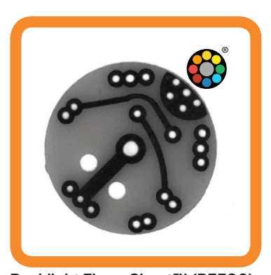
Backlight FluoreSheet™ (BF590) Blue LED Orange Bandpass Filter (BP590)