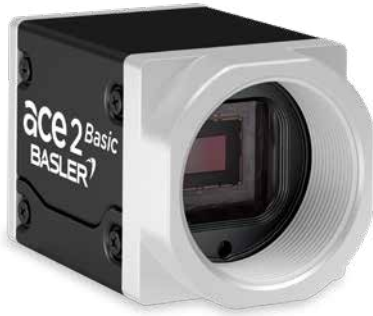
ace 2 Basic