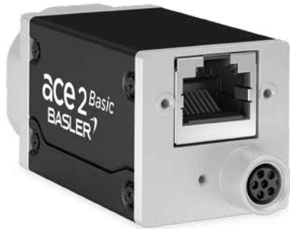
ace 2 Basic