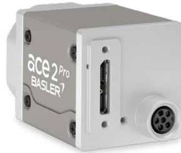
ace 2 Pro