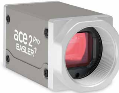
ace 2 Pro