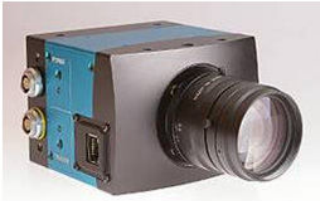
MotionBLITZ EoSens® Cube

High-speed cameras can capture the decisive moment of impact in slow motion, thus facilitating a comprehensive analysis of the process. At reduced resolution, recording rates can be increased to up to 200,000 frames per second. These extremely high frame rates are necessary to, for example, capture and better understand the precise moment when a fracture appears at a known weak point. The information these images provide can be further enhanced using image processing software. The process generates precise recommendations and suggestions for improvement for the development and production process.