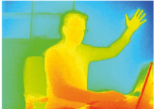
Sample "Gesture Control" Image Taken by ToF Camera