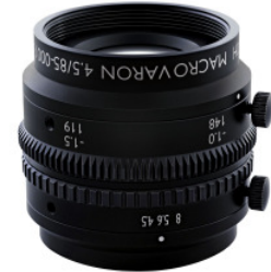
MACRO VARON 4.5/85

The special lenses Macro Varon and Macro Varon fixed beta designed for the highest requirements of web and surface inspections are the first choice for FPD and PCB inspection systems, for example. These applications require line scan lenses with very high resolution in order to guarantee cost-efficient error detection in manufacturing and the associated quality assurance processes. When using high-resolution cameras, the lens is often the limiting factor for the optimal utilisation of the theoretically possible system performance. These lenses, however, have been specially developed for the use of 12k line scan sensors. In the optical magnification range required these lenses fully exploit all the possibilities of the very latest sensor generation.