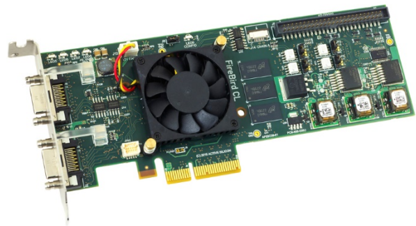
With low profile bracket