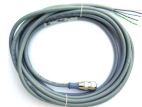
Light includes LDM DIN rail mount constant current driver and 4-meter cable

Monster Lights have changeable lenses for matching the area of illumination with the working distance