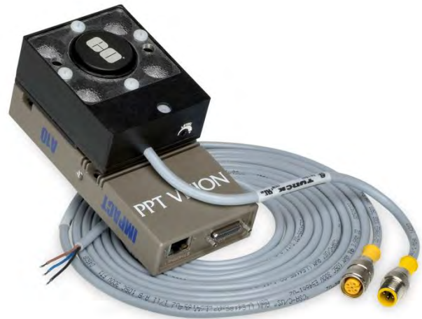
Light includes 4-meter cable - cable also available in 8, 15 and 30-meter lengths)

The RLD3 has 3 optic options for matching the area of illumination with the working distance